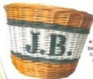
▲ Personalised wicker bicycle basket , £70, Hill & Ellis (020-3488 5890; www.hilandellis.com )