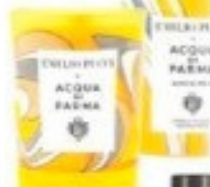
▲ Notte di Stelle candle , £72, Acqua di Parma ( www.acquadiparma.com )