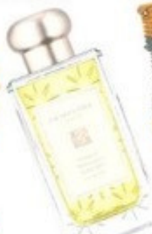
▲ Starlit Mandarin and Honey scent , £105, Jo Malone ( www.jomalone.co.uk )