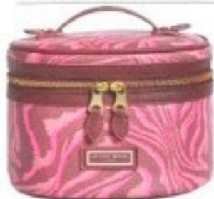
▲ Vanity case , £45, Otis Batterbee (020-3457 8425; www.otisbatterbee.com )