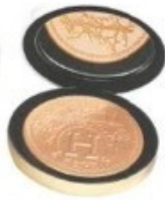
▲ Poudre d'Orfevre limited-edition illuminating powder , £75, Hermès ( www.hermes.com )