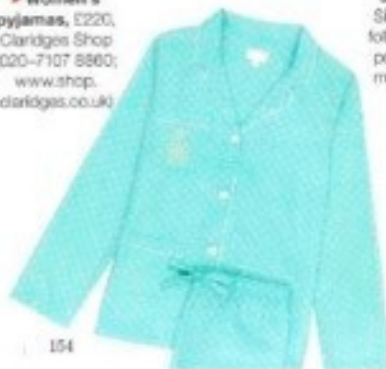
▶ Women's pyjamas , £220, Claridges Shop (020-7107 8860; www.shop.claridges.co.uk )