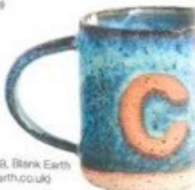
▶ Initial mug , £38, Blank Earth ( www.blankearth.co.uk )