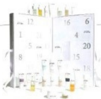
▲ Dr Barbara Sturm advent Calendar , £405 (020-7959 0840; http://en.drsturm.com )