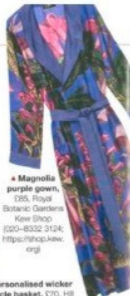
▲ Magnolia purple gown , £85, Royal Botanic Gardens Kew Shop (020-8332 3124; http://shop.kew.org )