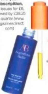
▲ The Hair Oil , 30ml, £38, Augustinus Bader ( www.augustinusbader.com )