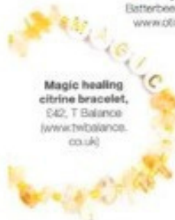
▲ Magic healing citrine bracelet , £42, T Balance ( www.tbalance.co.uk )