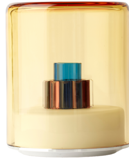
Ambra II with ametista & blue pavone SKU: GWL002 RRP: £360