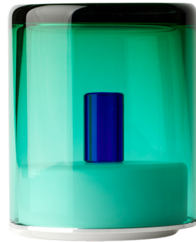
Verde I with blu cobalto SKU: GWL007 RRP: £330