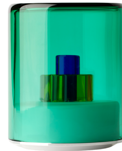
Verde II with ambra & blu cobalto SKU: GWL008 RRP: £360