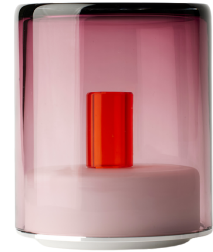
Ametista I with arancio SKU: GWL005 RRP: £330