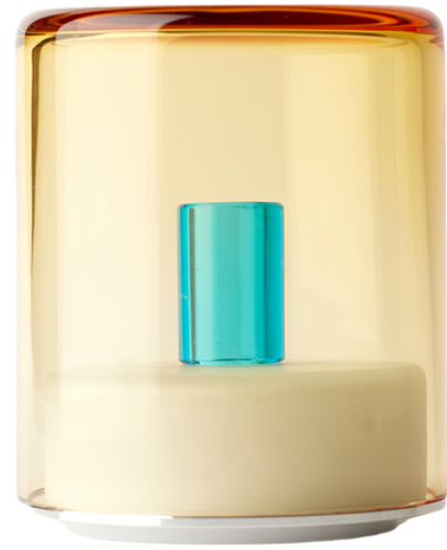
Ambra I with acquamare SKU: GWL001 RRP: £330