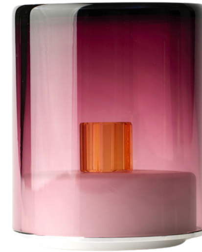
Ametista I with ambra SKU: GWL004 RRP: £330