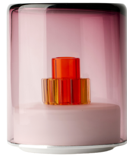
Ametista II with ambra & arancio SKU: GWL006 RRP: £360